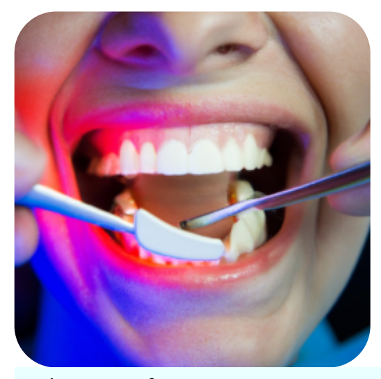
Oral Hygiene for Vapers